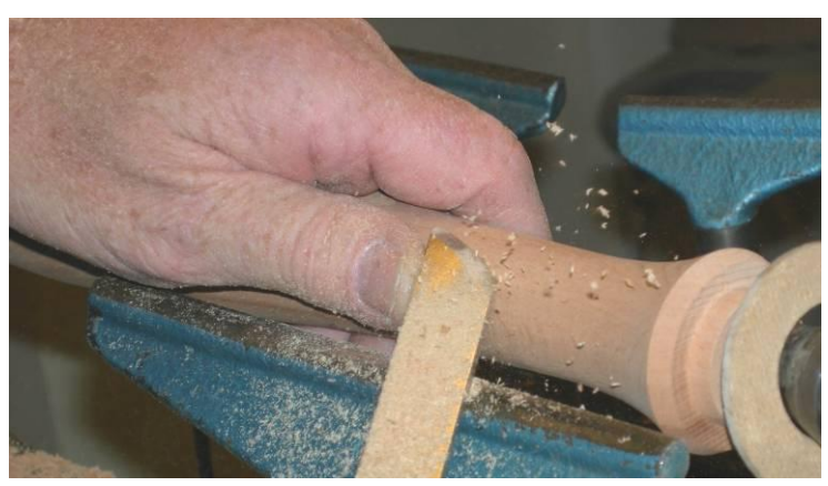
The second bevel can give you more clearance when turning the fiddly bits out.

Now turn the remaining profile of the spindle. Chris used a roughing gouge for this and finished off with a curved skew chisel for this, again with a double bevel. Using the curved chisel allows cutting forwards and backwards across the surface and reduces the tearing of the grain.