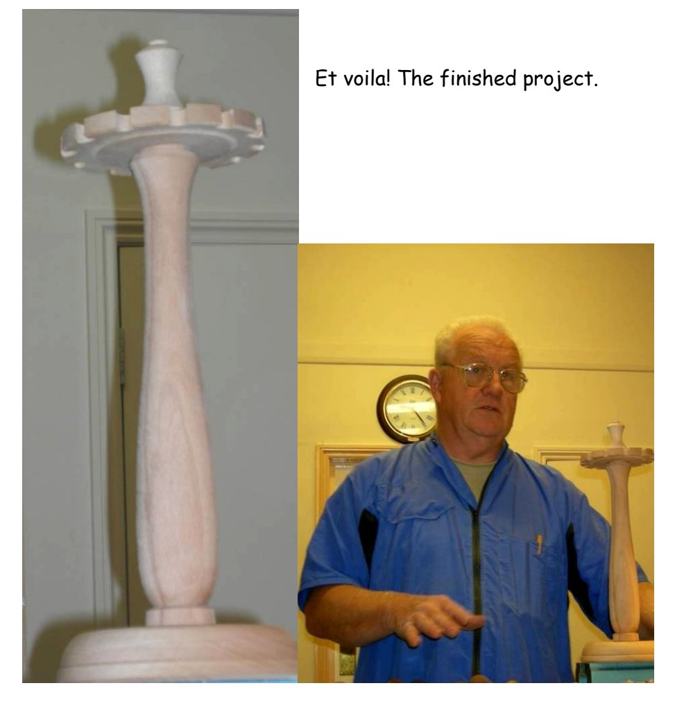
From Clare Stringer, our Boddington correspondent:

There is a new timber and woodturning supplier opened about 2\frac{1}{2} miles south of Stratford-upon-Avon off the A3400.